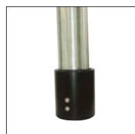
Zero-Calibrated (Calibration Board is set)