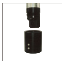
Calibration Board detached

By using secondary Zero Standard, Simple Zero-Calibration Board, Zero-Calibration Water is not necessary. (for the first Zero Standard, Pure Water is used)