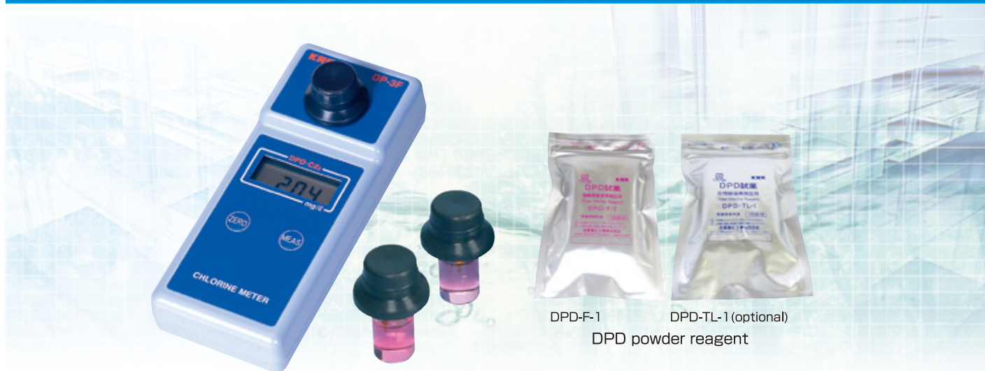
DPD-F-1 DPD-TL-1 (optional) DPD powder reagent