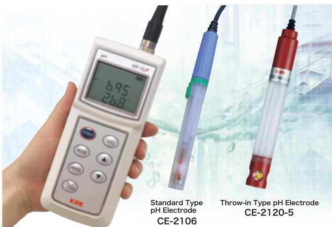
Standard Type pH Electrode CE-2106